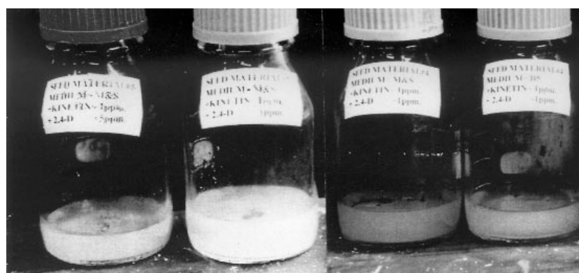
Figure 1. Appearance of varieties 4 and 5 with different media and hormone doses