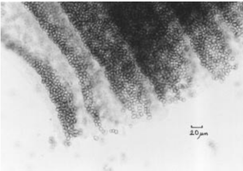
Figure 2. Sublamellate gleba of Galeropsis lateritia .

The authors wish to thank TÜBİTAK for financial support (Project No: TOGTAG/1727).