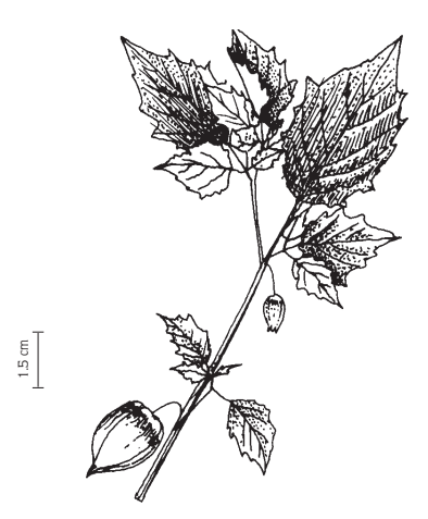
Figure 3. P. angulata inflorescence.

P. angulata was identified as P. lanceifolia in 1951 (6). According to Gleason, P. pendula and P. angulata