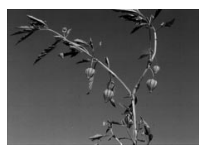
Figure 2. P. angulata habit.

or 10 ribbed. Corolla yellowish, 4-10 (-12) mm long unspotted or with indistinct spots. Anthers bluish or violet, 2-2.5 mm; filaments slender, 3-4 mm. Berry 10-12 mm in diameter, seeds yellowish, flattened, ovate or broadly elliptic, subsmooth. Flowering time June-October in Turkey.