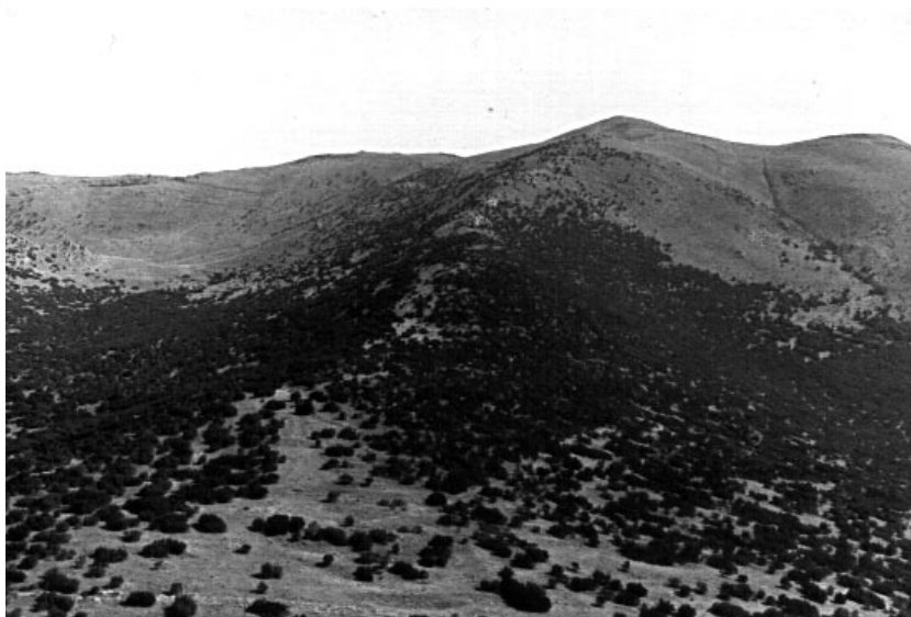
Figure 4. Remnants of deciduous oak woodland in the Küçük Göllüdağ on the road Güzelyurt-Çiftlik.

Fairly large expanses of woodland dominated by white oak ( Quercus pubescens Willd.) are found in the Göllüdağ Mountains, a northern extension of the Melendiz Mountains (Figure 4). East of Çiftlik, mixed woodlands of white oak and vallonea oak ( Q. ithaburensis Decne ssp. macrolepis (Kotschy) Hedge & Yalt.) predominate. Turkey oak ( Q. cerris L.) is the predominant species on the northern slopes of the Hasan Dağı volcano, but also vallonea oak and white oak are locally present. White oak was the only oak species encountered on the south slopes of the Erdaş Dağı. The Ekecik Dağı woodlands, north of Aksaray, could not be visited and were only seen from a