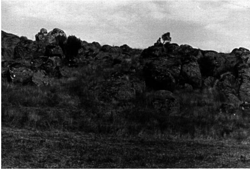
Figure 3. Rock outcrop near Köprüköy with Prunus ursina (above left) and Celtis tournefortii (above right)

oaks. This outcome suggests special ecological conditions on the outcrops that do not match the ecological demands of oak, but might explain the occurrence of the present peculiar vegetation.