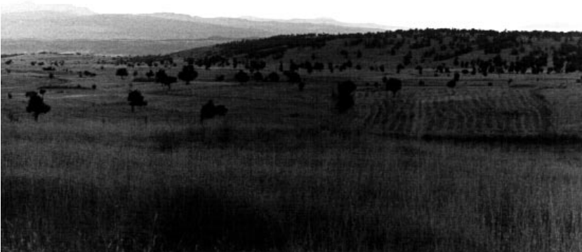
Figure 5. Wild orchard trees (foreground) and oak remnants (background) in Hasan Dağı.

Palynological research of a sediment core from a volcanic lake near Acıgöl, northwestern Cappadocia (Figure 1), demonstrates a steady advance of oak woodland from 10000-8000 BP onwards and a maximum expansion between 8000 and 4000 BP (Woldring & Bottema, pers. comm. ). An abrupt decline of oaks starts around 4000 BP. In response to this large-scale deforestation, it is very likely that wild fruit trees took advantage of this new situation. Unfortunately, such a shift in the composition of woody species is not visible in the pollen diagram. This can be explained by differences in pollen dispersal. A fairly large number of woody species have extremely poor pollen dispersal due to their entomophilous nature, i.e., requiring pollination by insects. This type of pollination seriously reduces the atmospheric release of pollen and pollen counts contrast strongly with the number of pollen released by wind-