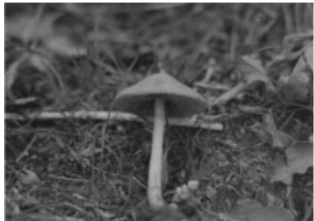
Figure 3. Basidiocarps of Psathyrella bifrons (1/1 life size).

Sertavul village, in walnut orchard as gregarious, 1500 m, 04.05.2000, Doğan, Öztürk, Kaşık 554.