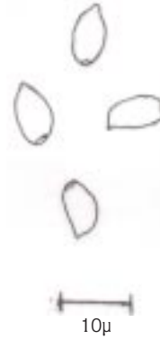
Figure 6. Basidiospores of Psathyrella cernua .

Spores 7-8 x 4-5 µ, elliptic, smooth (Figure 6), reddish-brown, with a germ pore.