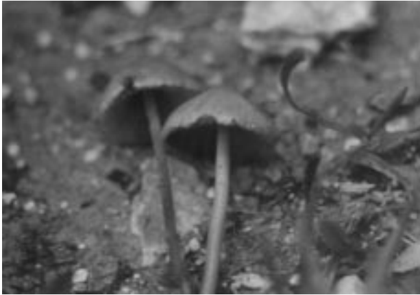
Figure 13. Basidiocarps of Conocybe fuscimarginata (1/1 life size).