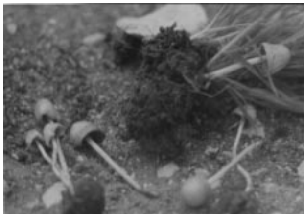
Figure 11. Basidiocarps of Conocybe subpubescens (1/1 life size).

Pileus 1-2.5 cm across, conical campanulate (Figure 11), surface smooth, hygrophorous, bright ochre-rust brown, strongly sulcate. Flesh cream whitish, thin, odour or smell not distinctive. Lamellae cream-coloured when young, then cream-ochre to rust-brown, finely adnexed, edges smooth to whitish-flocculose. Stipe 8-10 x 0.1-0.2 cm, cylindrical, stipe base bulbous and base with whitish mycel, very heavily downy-hairy, rust brown.