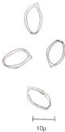
Figure 14. Basidiospores of Conocybe fuscimarginata .