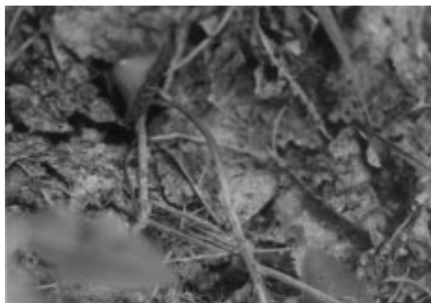
Figure 15. Basidiocarps of Conocybe tenera (1/1 life size).

acute, sometimes dentate. Flesh cream-coloured to ochre, thin, almost odourless, taste mild, not distinctive. Lamellae cream-coloured when young, rust-brown when old, narrowly adnate, edges whitish-floccose. Stipe 4-8 x 0.1-0.2 cm, cylindrical, base slightly bulbous, hollow, fragile, surface smooth, with pale powder toward the apex, light brown when young, then increasingly dark red-brown, especially toward the base.