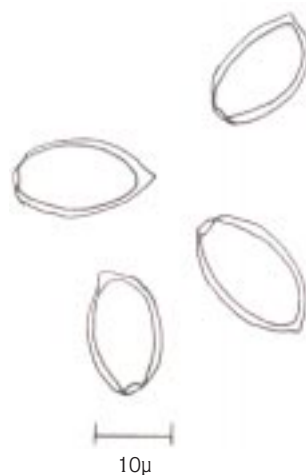
Figure 12. Basidiospores of Conocybe subpubescens .

7. Conocybe fuscimarginata (Murr.) Sing. Nova Hedwigia , 29: 210, (1969).