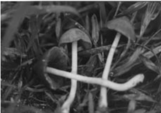
Figure 5. Basidiocarps of Psathyrella cernua (1/1 life size).

Pileus 1.5-3.5 cm across, hemispherical when young, then convex to plane and sometimes irregular in shape (Figure 5), centre with an obtuse umbo, surface strongly hygrophanous, dull, smooth, dark grey-brown with a reddish tone and translucent-striate up to halfway to the centre when moist, light cream-coloured to almost whitish when dry, margin smooth when young, undulating when old. Flesh whitish to grey-brown, thin, odour spicy, taste mild. Lamellae whitish when young, then light grey-brown to dark red-brown, broadly adnate, some with a small decurrent tooth, edges finely whitish-to brownish-floccose. Stipe 2.5-7 x 0.2-0.5 cm,