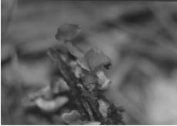
Figure 7. Basidiocarps of Psathyrella murcida (1/2 life size).