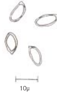
Figure 18. Basidiospores of Pholiotina aporos .