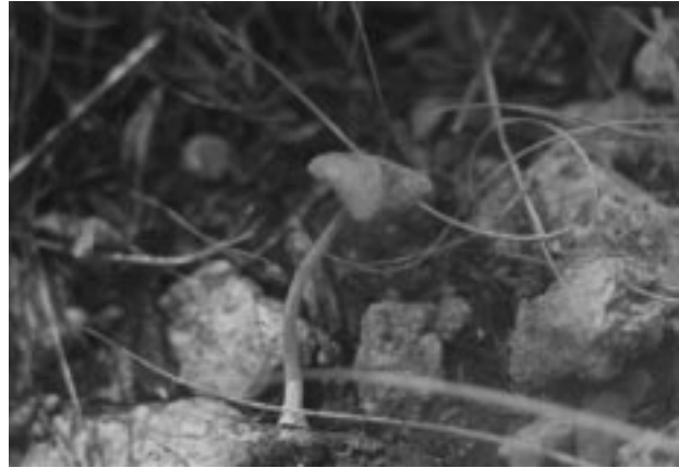
Figure 9. Basidiocarps of Agrocybe splendida (1/1 life size).

Stipe 0.5-2(3) cm across, hemispherical when young, then convex to plane, centre sometimes depressed or slightly umbonate (Figure 9), surface lubricous and ochre- to gold-yellow when moist, silky and cream-coloured to light yellow with a darker centre when dry,