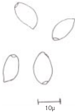
Figure 4. Basidiospores of Psathyrella bifrons .