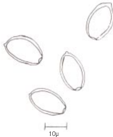
Figure 10. Basidiospores of Agrocybe splendida .

Spores 13.5-16.5 x 8-10.5 \mu , elliptic, smooth (Figure 10), light red-brown, thick-walled, with a germ pore.