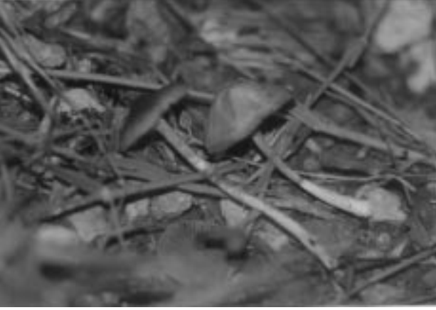
Figure 17. Basidiocarps of Pholiotina aporos (1/1 life size).

hollow, rigid, elastic, surface above the annulus light beige-brown and faintly longitudinally striate, surface below increasingly brown to dark brown and in part somewhat pale-fibrillose, annulus membranous-tomentose, pendent, white, upper side striate.