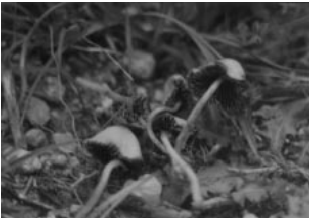
Figure 1. Basidiocarps of Psathyrella badiophylla (1/1 life size).

Pileus 0.5-2 cm across, conical-campanulate when young, then campanulate to campanulate-convex (Figure 1), surface smooth, dull, reddish-ochre, brown when young, pallid-tawny to almost whitish when dry. Flesh light to dark brown, thin, odour pleasantly polyporoid, taste mild. Lamellae whitish grey when young, then turning deep brown to tobacco brown-cinnamon brown, broadly adnate. Stipe 2-5.5 x 0.1-0.2 cm, cylindrical, whitish-cream, surface thin longitudinally fibrillose, fragile.