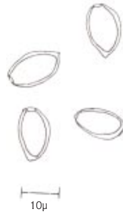
Figure 16. Basidiospores of Conocybe tenera .

Spores 10.5-14 x 5-7 µ, elliptic, smooth (Figure 16), thick-walled, red-brown, with a germ pore.