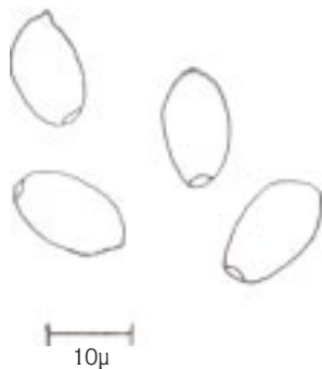
Figure 2. Basidiospores of Psathyrella badiophylla .

Spores 10-14 x 5-6 \mu , elliptic, smooth (Figure 2), dark red-brown, with a germ pore.