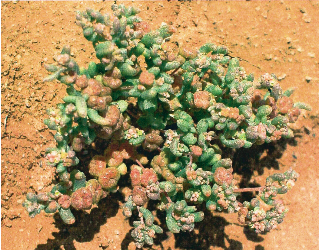
Figure 2. Habit of Tetradiclis tenella .