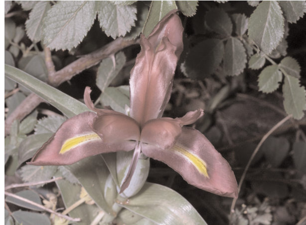
Figure 3. Iris nezahatae Güner & H.Duman, type material (A.Güner 14024-M.Johnson, M.Öztekin, R.Unwin, P.Ravenhill), (photo by Adil Güner).

cm longa, basi 0.8-1.6 cm lata, leviter undulata, acuminata, marginibus albis, levibus vel scabrellibus, supera nitido-viridia, infra glauca et distincte et ordinate nervosa. Bracteae et bracteolae fere aequales, arcte vaginans tubo perianthorum; bracteae 4-6.2 x 1.3-1.6 cm, lanceolatae, viridis, acuminatae, ad marginem membranaceae, dorsaliter leviter carinatae; bracteolae 4.5-5.5 x 1.5-2.1, ovatae vel lanceolatae, acutae vel acuminatae, non carinatae, membranaceae margine et in dimidio inferiore. Perigonium 5.5 cm diametro, rubello-brunneum, interdum pallentior crista lutea; tubus perigoni 2.4-3.6 cm longus, interdum interne hirsutus; segmenta exteriora 3.5-4 x 1.3-1.7 cm, oblonga, ungue parum alata, linea mediana angusta, lutea, lamina 1.2-1.4 x 1.2-1.3 cm, oblonga, lamina ungue lata fere aequalis vel leviter angustior, crista c. 2.5 mm alta, undulata, lutea; segmenta interiora reflexa vel patentia, 1.5-1.7 x 0.4-0.5 cm, lanceolata, irregulariter dentata; styli 3.1-3.6 x 1-1.4 cm, rubello-brunnei margine pallentior vel albidii; stigma bilobata et retusa, 0.1-0.2 x 0.4-0.5 cm; stamina 2.1-3 cm longa, filamenta 1.3-1.9 cm longa, eburnea, anthera 1.1-1.3 cm longa, eburnea, pollen eburneum. Capsula oblongo-cylindracea, circa 2 x 1 cm, rostro circa 1 cm longo. Semina ovoidea, circa 4 mm diametro, rugosa.