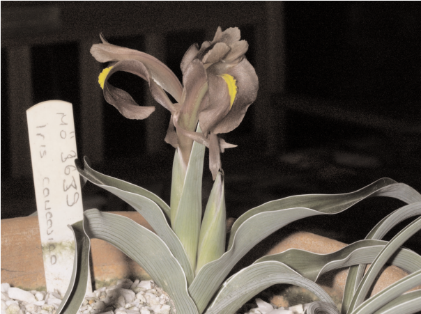
Figure 2. Iris nezahatae Güner & H.Duman (collectors: M. Öztekin 3639-A.Güner, F. Tezcan, H.B. Güner, accession number: 2004-452B).