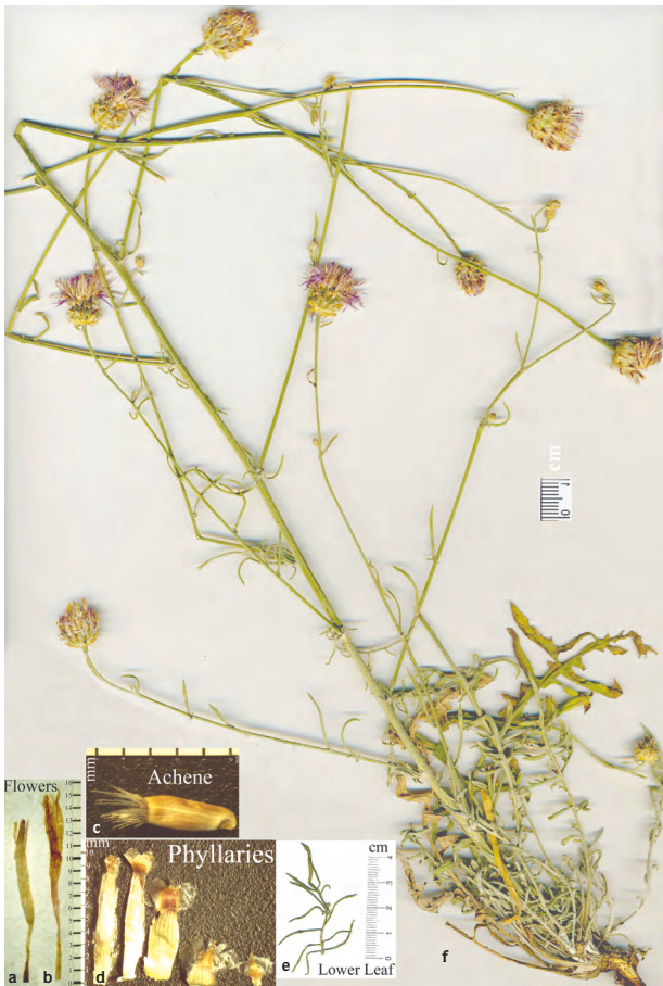
Figure 1. Centaurea aziziana . a. fertile flower; b. sterile flower; c. achene; d. phyllaries; e. lower leaf; f. habitus.