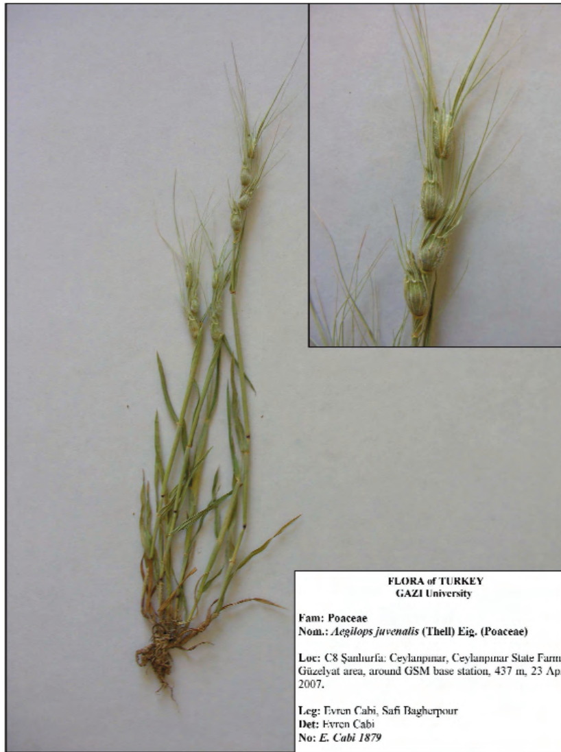
Figure 1. Habit of Aegilops juvenalis (Thell) Eig.

narrowly ovate to elliptical, with 2 sharp, setulose keels ending in an acute apex. Flowering in April-May. Steppe and edge of cultivated fields, 400-450 m.