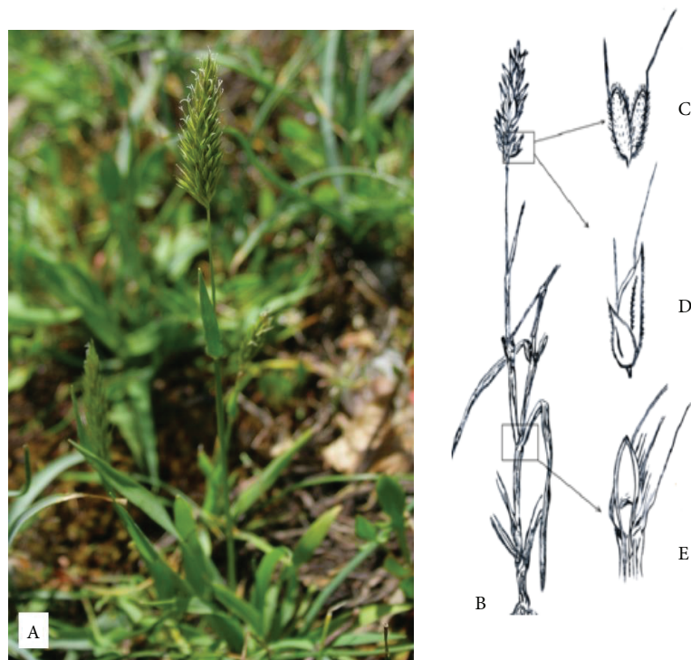
Figure 2. Anthoxanthum aristatum . A- habit, B- stem, C- florets ( \times 4 ), D- spikelet ( \times 4 ), E- ligule ( \times 5 ).

lanceolate, (4–)5–7.5(–8) mm long; breaking up at maturity, usually 10 or more. Glumes exceeding apex of florets; hyaline, with green keel enfolding them. Basal sterile florets dissimilar; without significant palea; attached to and deciduous with the fertile. Lemma of sterile floret oblong; 2.8–3.9 mm, membranous, 1-keeled, 4–5-veined; pilose, awned. Awn of upper sterile floret dorsal; arising 0.1 mm up back of lemma; 7–10 mm long. Fertile lemma suborbicular; (1.4–)1.6–2.1 mm; unkeeled; margins convolute. Palea oblong; without keels. Flower lodicules absent. Anthers 2; 2.8–4.1 mm long. Stigmas 2, pubescent. Caryopsis ellipsoid.