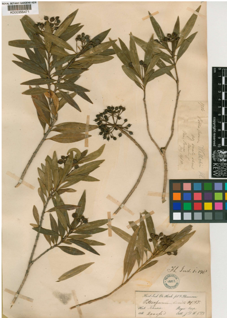
Figure 2. Lectotype of Pittosporum humile Hook. f. & Thomson (K000356471).

of Wight cat. n. 141 were traced (E00174314, E00174315, GHU000273233, K000356477, NY00388148, P00698057, and P00698058) and one of Wight cat. n. 544 (E00174316). Of these, E00174314 is better preserved and more complete than the other specimens and best represents the species description given in the protologue; hence it is designated here as the lectotype.