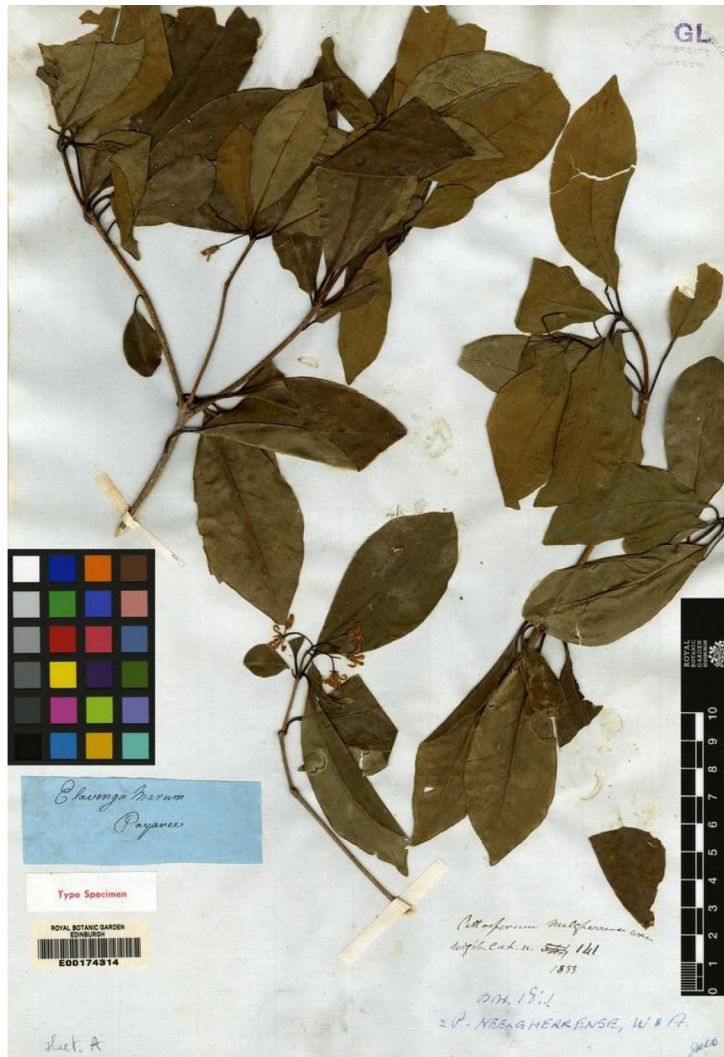
Figure 3. Lectotype of Pittosporum neelgherrense Wight & Arn. (E00174314).