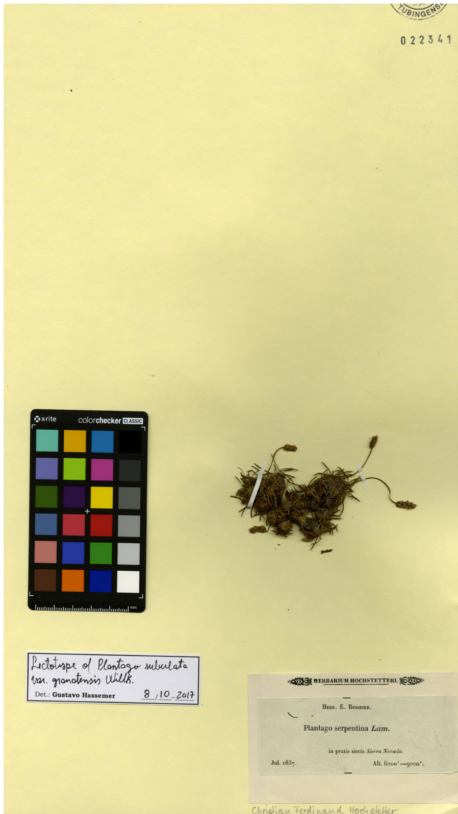
Figure 3. Lectotype of Plantago subulata var. granatensis (E. Boissier s.n., TUB-022341).