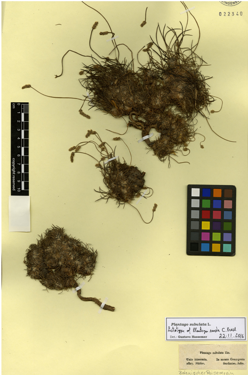
Figure 1. Lectotype of Plantago sarda (F.A. Müller s.n., TUB-022340).