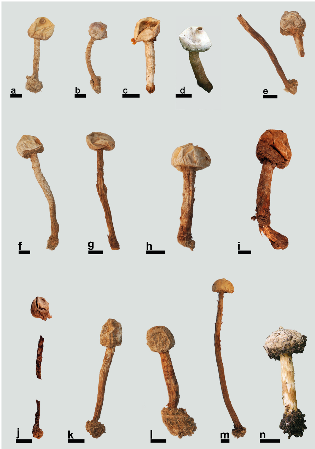
Figure 2. Basidiomes. a- Tulostoma simulans (03MCF3059); b- T. brumale (03MCF1220); c- Tulostoma sp. 1 (07MCF9359), as Tulostoma sp. 13 in Jeppson et al. (2017); d- T. cf. moravecii (07MCF8292); e- Tulostoma sp. 2 (02MCF1203); f- T. punctatum (05MCF4866); g- T. lusitanicum (03MCF4751); h- T. winterhoffii (06MCF6231B); i- T. fimbriatum (07MCF6656); j- Tulostoma sp. 3 (03MCF2939); k- Tulostoma sp. 4 (03MCF10327); l- T. melanocycum (06MCF6448); m- T squamosum (03MCF1226); n- T. subsquamosum (07MCF8291). Scale bars: 0.5 cm. Letters (a–n) correspond to subclades and branches shown in Figure 1.