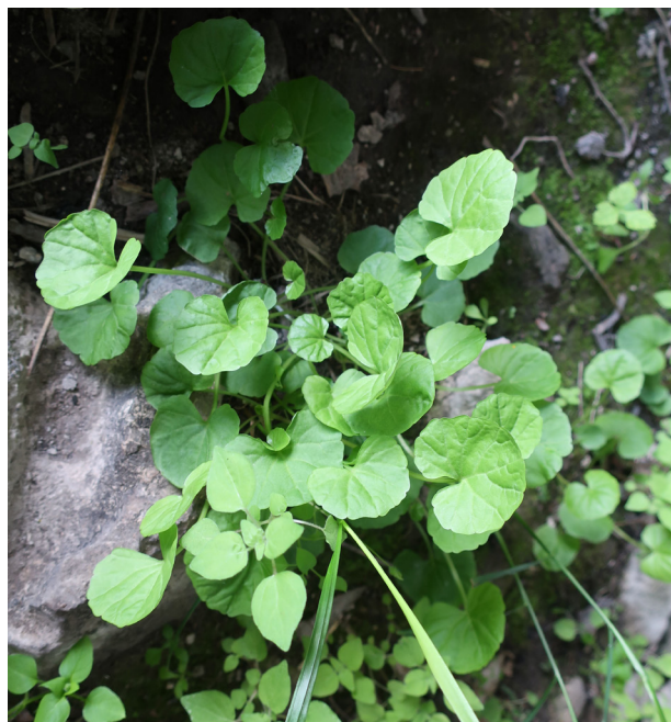
Figure 2. Megadenia speluncarum Vorob., Vorosch. & Gorovoj at the Vitiaz' bay (Russian Far East, Primorskiy kray) aside the road between Alexeevka and Vitiaz', in shady broad-leaved forest, near the brook, June 2018, phot. M. Olonova.

speluncarum ). Later the taxonomic status of these species was evaluated, and all three species, due their high morphological similarity, were synonymized as Megadenia pygmaea (Berkutenko, 1998; Zhou et al., 2001; Ostroumova and Berkutenko, 2010). Finally, detailed research, using molecular methods, allowed Artyukova, Kozzyrenko, and Gorovoy (2014) to restore the species status for Megadenia speluncarum . Their data on the plastid genome revealed a clear subdivision of the genus into three lineages matching the three described species.