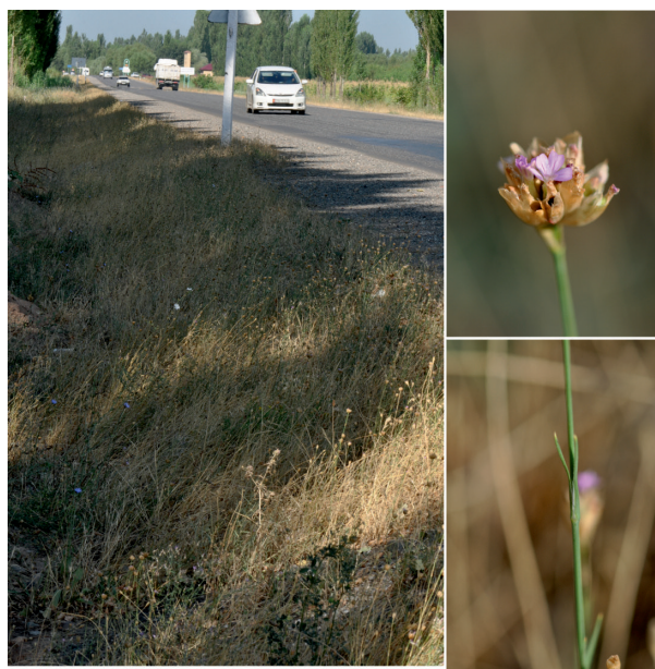
Figure 3. Petrorragia prolifera (L.) P.W.Ball & Heywood, roadside, ca. 6 km S of Jalalabad in Kyrgyzstan, July 2016, phot. M. Nobis.

The genus Petrorragia (Ser. ex DC.) Link includes ca. 20 species distributed mainly in the Mediterranean