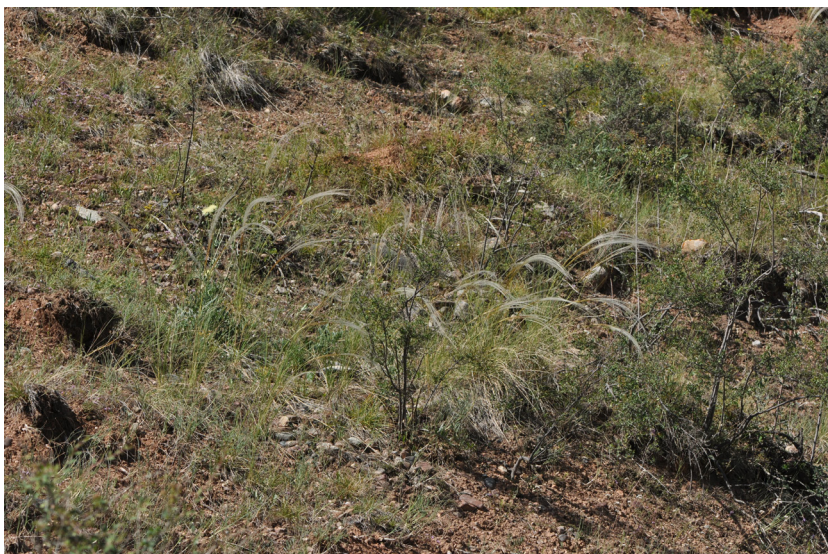
Figure 5. Stipa pulcherrima K. Koch, ca. 36.5 km NNE of Naryn in Kyrgyzstan, July 2018

The revision of Thymus L. in the IRK herbarium (Irkutsk, Russia) resulted in finding specimens collected from Irkutsk Oblast and representing Thymus lenensis , providing the first record of this species from the southern part of Siberia.