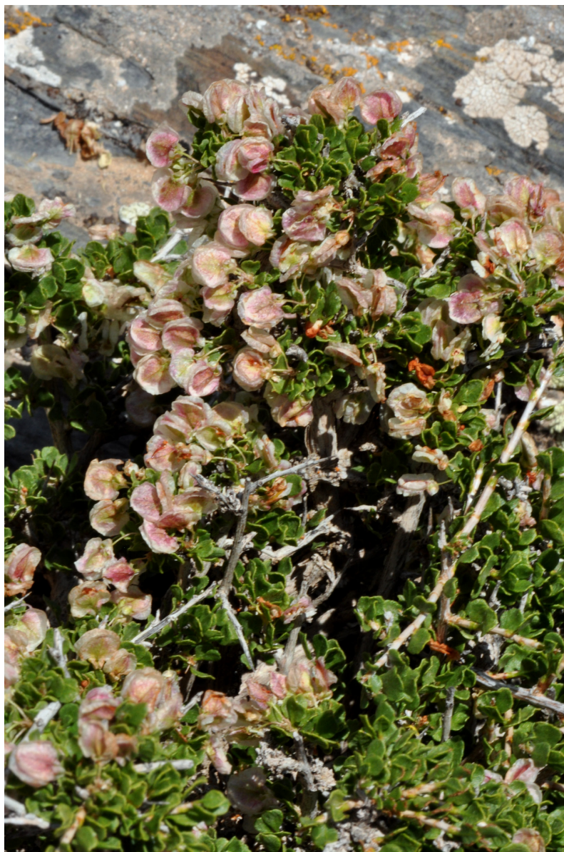
Figure 1. Atraphaxis karataviensis Pavlov & Lipschitz near Damburacha settlement in Tajikistan, June 2015, phot. A. Nowak.