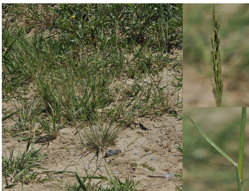
Figure 4. Puccinellia schischkinii Tzvelev, near At-Bashy in Kyrgyzstan, July 2018, phot. M. Nobis.

Solanum physalifolium is a species native to the Andes (Argentina, Bolivia and Chile). It is adventive and naturalized in Europe, western Canada, the northwestern United States, equatorial regions of Africa, and it has been introduced into Australia and New Zealand where it persists as a weed of cultivation (Edmonds, 1986; Edmonds and Chweya, 1997). The species grows in ruderal habitats, on railways embankments, in fields and disturbed areas. In Russia, it was collected in Kursk, Moscow, Ryazan Oblasts, the Republic of Mordovia (Mayorov, 2014), Udmurt Republic (Melnikov, 2011), however, it has not been encountered in the eastern regions of the country.