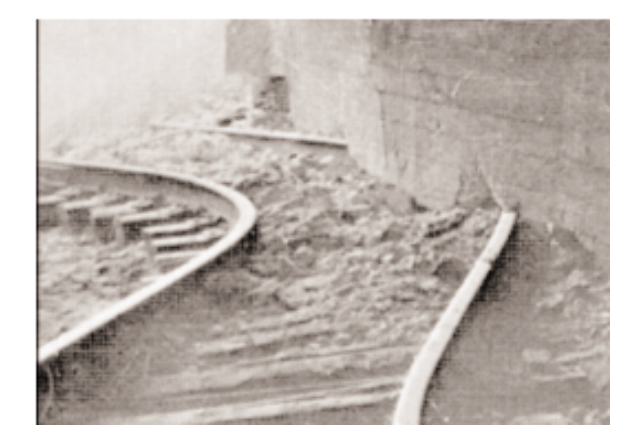
Figure 3. Bent rails inside the Kern County urban railway tunnel. The White Wolf Fault had a both compressive and lateral dislocation during the 1952 Kern County earthquake. Indicative of this type of fault dislocation is the fact that the rails are bent and continuous underneath the tunnel wall, showing that the wall was lifted up enough for the rail to slide underneath.

Furthermore, a study of reactivated faults crossing tunnels at a depth of a few tens to several hundred metres below surface gives the rare opportunity to study the difference in the pattern between surface and deeper deformation; a deformation pattern that cannot certainly be seen in trenches cut at a depth of a few metres. In the case of the Wrights tunnel for instance, the fault offset at