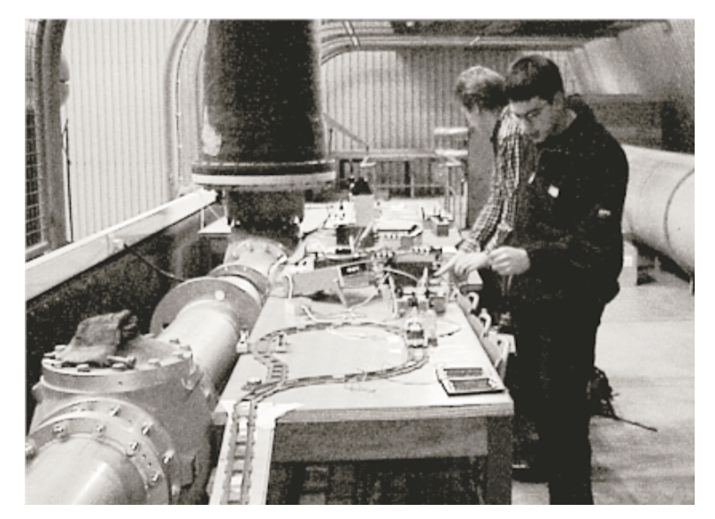
Figure 2. Freshmen testing their design of a durable railroad connection in the high voltage lab.

Figure 1. EEE drivers of the electrical power industry over a period of about two decades.