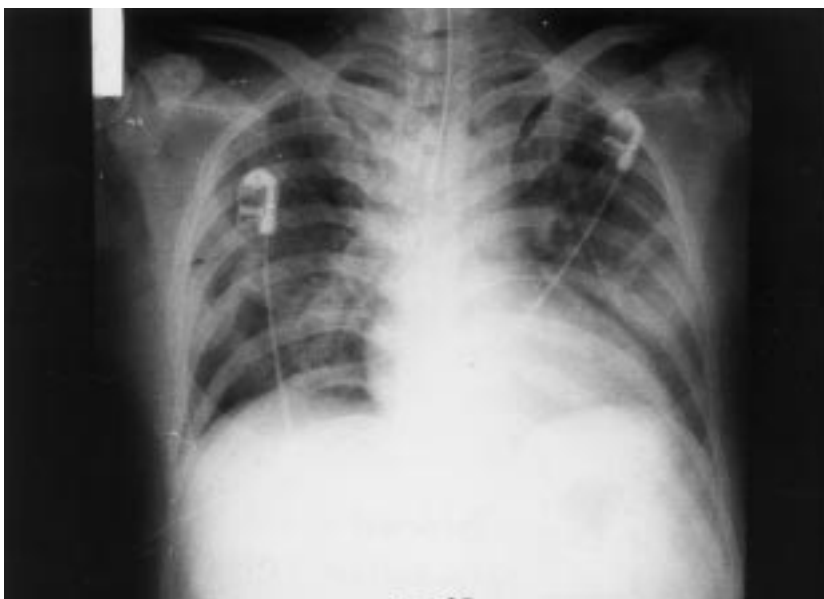
Fig. 2. Radiological findings were normal at the end of therapy.

psittacosis and the well documented phenomenon of adult respiratory distress syndrome. The infection responded well to erythromycin and tetracycline, which are also effective against psittacosis.