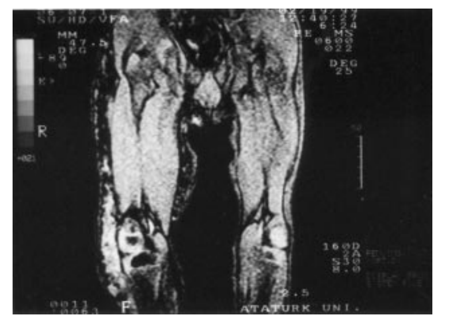
Figure 4. Varicose venous dilatations are well seen as bright signals on gradient-echo T2weighted MR image.

Venography and arteriography is performed for treatment planning. Arterio-venous fistula associated with Parker-Weber syndrome can be detected by arteriography.