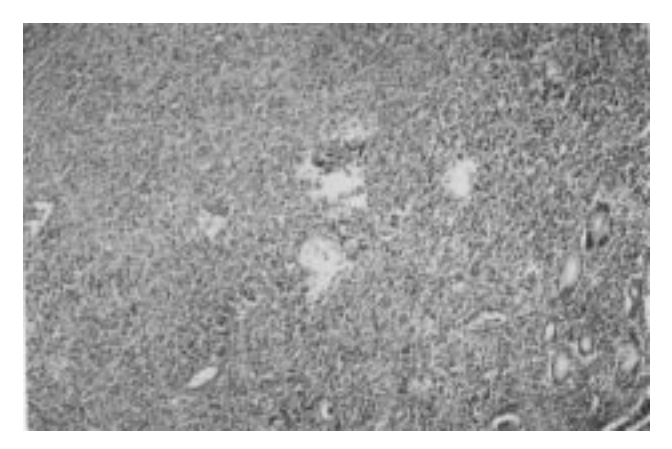
Figure 2. Histological appearance of poorly differentiated adenocarcinoma of diffuse type. (Hematoxylin-eosin x32)