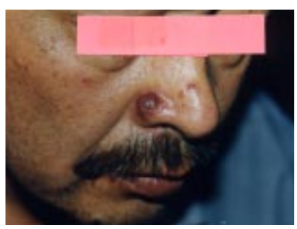
Figure 3. A patient had second lesion on his nasu-labial sulcus.