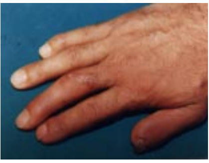
Figure 2. Another lealed orf lesion on the Figure 3. finger.