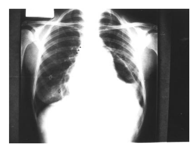
Figure 1. The chest X-ray revealed that there were two obvious radiolucent areas along both heart borders with intrapericardial fluids, suggesting pneumopericardium (open arrows). It also showed a thin radiolucent area outlining the right mediastinum, suggesting possible pneumomediastinum (arrow heads).

A 40-year-old female patient was admitted to the hospital for double valve replacement (mitral, aorta). The mediastinal cavity was opened by median sternotomy. However, the bilateral thoracic cavity was not opened. She underwent surgery by means of cardiopulmonary bypass and cold potassium cardioplegic arrest. Aortic and mitral valves were replaced. On the first postoperative day, she was extubated and placed on a conventional face mask for oxygenation. The patient showed an uneventful recovery in the early postoperative period. As she had had significant elevation of pulmonary vascular resistance, she took oxygen with the face mask intermittantly. On the 4th postoperative day, both of the drainage tubes were removed, and the chest film showed a normal cardiac silhouette. Then the patient was treated with an angiotensin- converting enzyme inhibitor (ACEI) (Enalapril 5 mg/day). On the 7th postoperative day, the routine chest X-ray revealed that there were two obvious radiolucent areas along both heart borders with intrapericardial fluid, suggesting pneumopericardium. The chest radiograph also showed a thin radiolucent area outlining the right mediastinum, suggesting possible pneumomediastinum (Fig. 1). Computerized tomography showed bilateral airspace consolidation and