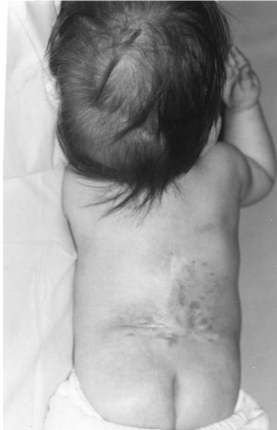
Figure 4. The myeloschisis defect closed completely by the epithelization of cutaneous tissues over the Tutoplast dura 3 months after the operation.

fibrin glue. The tightness values for neuropatch fixed only with sutures are similar to those for the best heterologous substitutes implanted with additional fibrin glue. Lyodura, Tutoplast dura and Neuropatch ought to demonstrate favorable implantation characteristics; they must consist of thin, flexible and easily suturable nature. Because neither adhesions to the nervous tissue nor space-occupying scars have been noted, these results confirm the excellent suitability of Lyodura and Neuropatch for dural substitution (11). Since tethering of the spinal cord is a well-recognized problem, to avoid retethering a wide Tutoplast duraplasty is recommended (12).