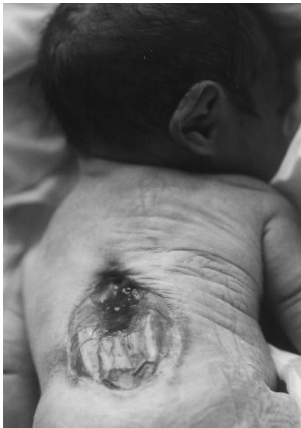
Figure 1. The patient is seen with a large myeloschisis defect.