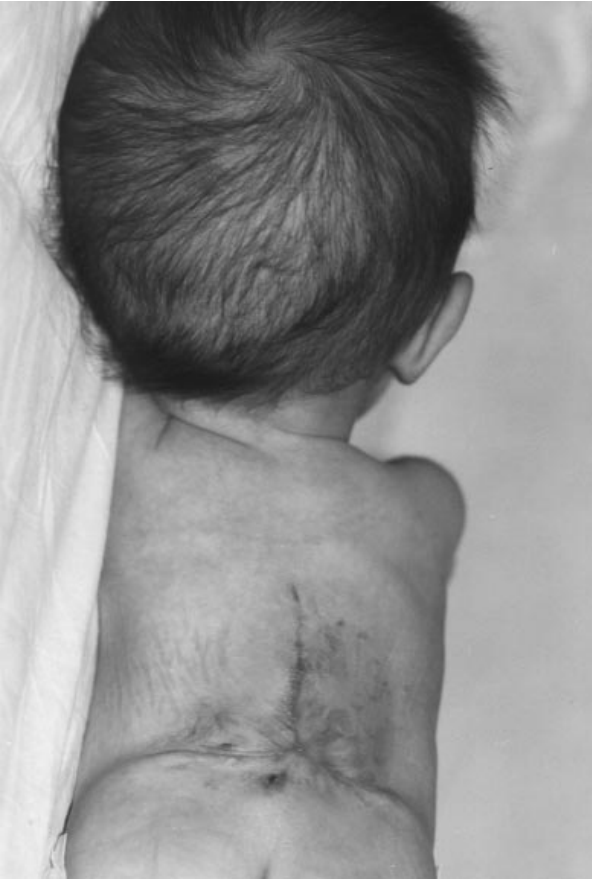
Figure 3. The patient is seen after the reconstruction and closure of the defect completely by "Y" plasty on day 2 of surgery.