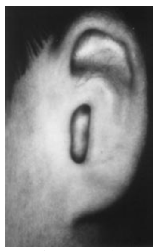
Figure 1. Patient with left atypical microtia.

scapha, antihelix, and triangular fossa were well defined after this operation. This was followed up for 3 years in the postoperative period. After this long period all components continued to be well defined in the left ear (Figure 3).