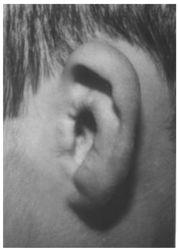
Figure 3. Overall lateral view of the constructed ear 3 years postoperation.

the remnant cartilage in their framework fabrication. All techniques may result in conspicuous long scars in the infraauricular, retroauricular and donor regions. There are many complications atlendant upon auricle reconstruction, such as flap necrosis, infections, and