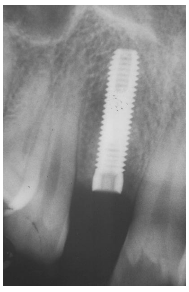
Figure 2. Periapical radiograph showing single implant in the right maxillary lateral incisor region.

The trial metal porcelain crown was processed and finished to completion. An interocclusal registration was made. The occlusion of the crown was corrected, and the crown was cemented onto the implant (Figure 3 a,b,c,d)