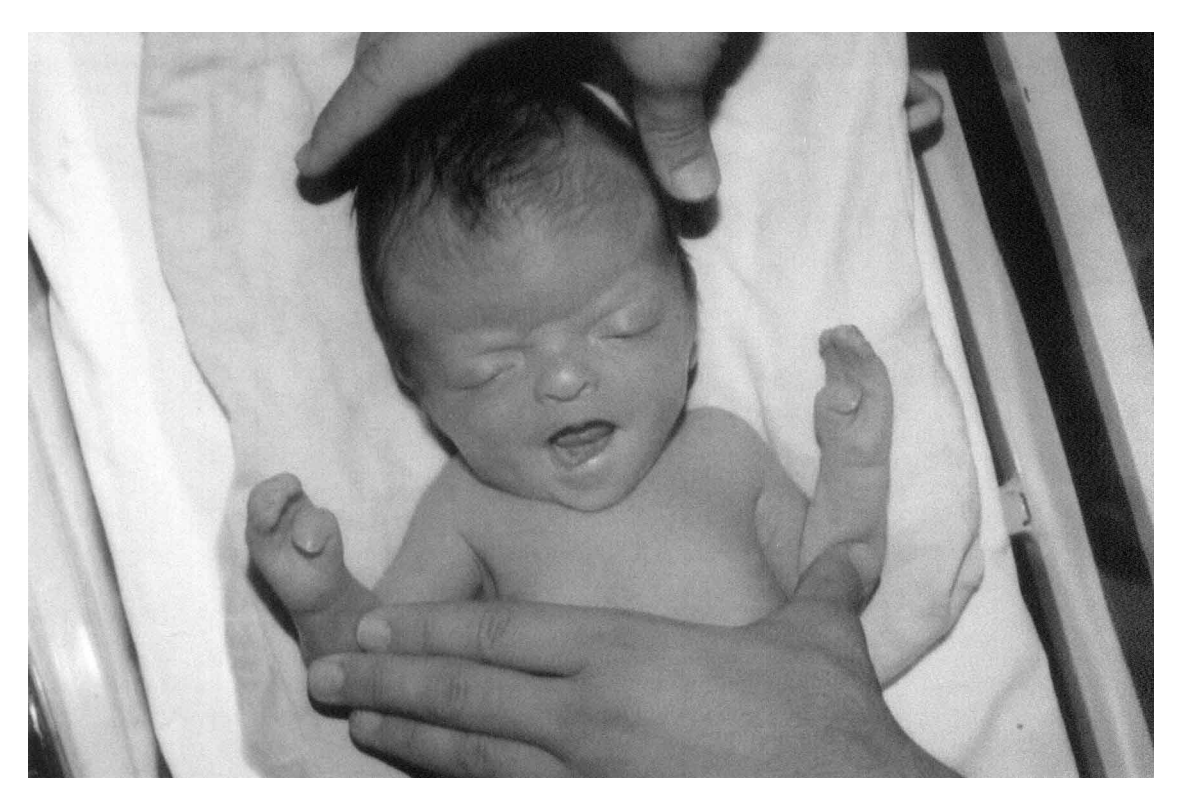
Figure 1. Facial appearance and syndactyly in the hand.