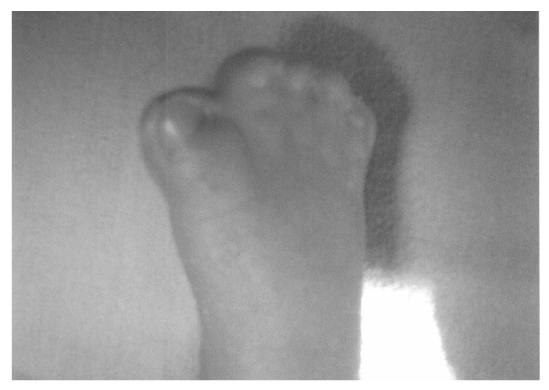
Figure 2. Syndactyly in the feet.