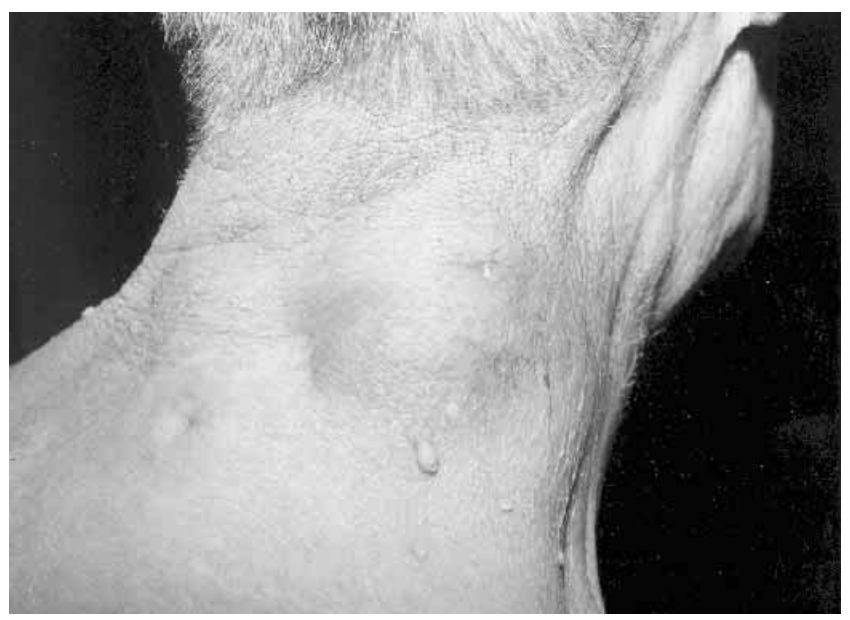
Figure 1. A firm, circular, slightly tender mass on the neck.