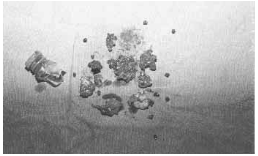
Figure 3. Debridement specimen from the neck.