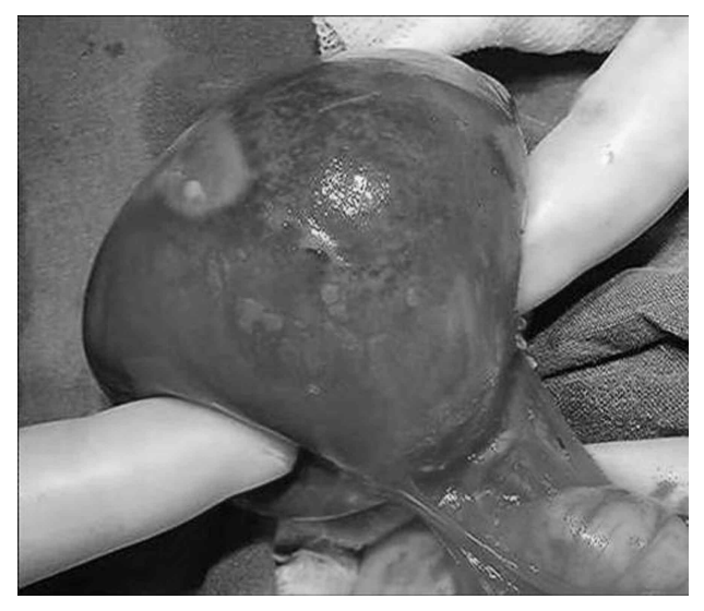
Figure 5. Tuba-ovarian torsion cyst.

The ovarian cyst is the most common intra-abdominal cystic lesion in the female neonate (1). If the ovarian cyst is simple and small in size, it can spontaneously involute within the first few months of life, due to the decrease in maternal hormonal stimulation that occurs after birth and therefore conservative management is preferred (3). However, it is recommended that a large, simple neonatal ovarian cyst (4 cm or more) should be surgically removed since they are prone to torsion (3). Torsion is the most common complication in larger ovarian cysts, and complex ovarian cysts, regardless of size, should be surgically removed, since they predispose to torsion, neoplasm or some other possible complications (2).