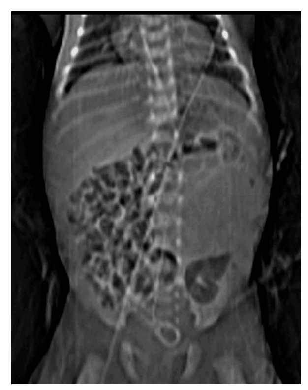
Figure 1. In plain film; bowel loops are displaced to the right side of the abdomen.