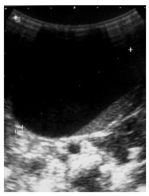
Figure 2. US examination shows the cystic mass.