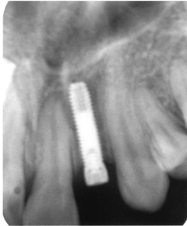
Figure 2. Periapical radiolucency was observed in the apical region of the dental implant.

The patient was diagnosed with a periapical dental implant lesion. The possibly of excessive tightening during surgical insertion or the contamination of the apical