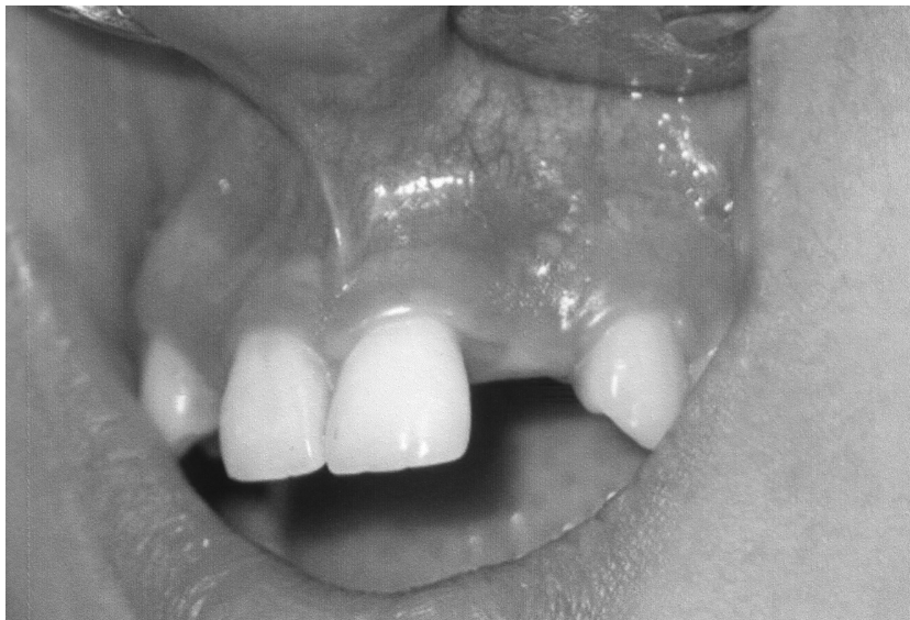
Figure 1. Slight gingival swelling was diagnosed during the intra-oral evaluation.