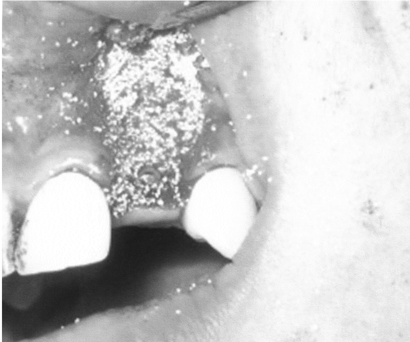
Figure 4. An allograft was applied after the debridement of the bony defect.