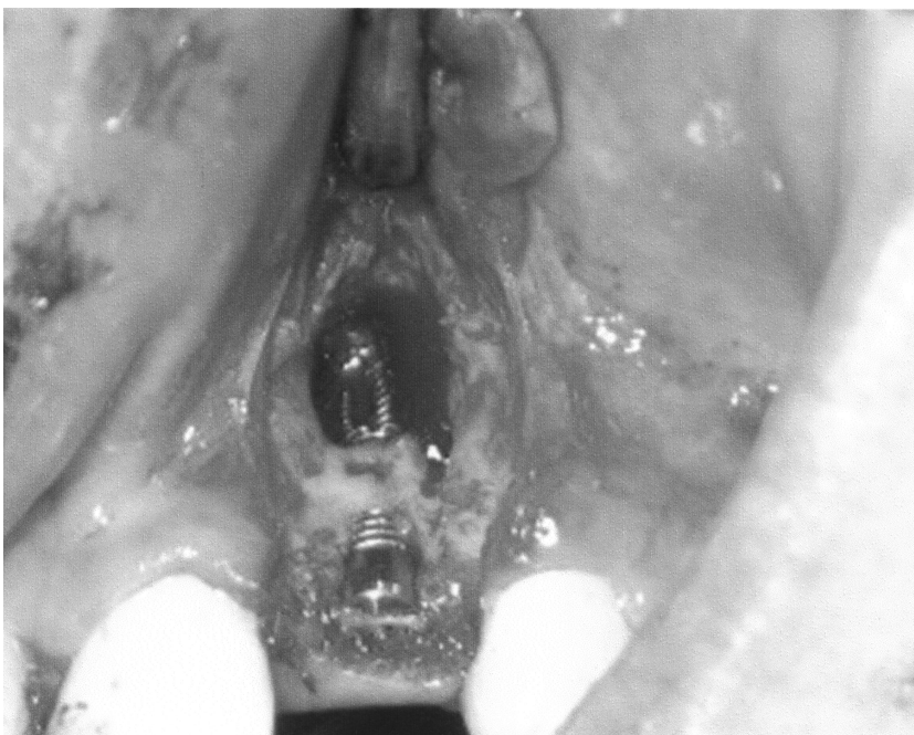
Figure 3. Complete loss of a vestibular alveolar cortical plate with a large periapical defect was noted during surgical debridement.

Sussman reported that PIPs occurred due to the infection of adjacent natural teeth that contaminated the