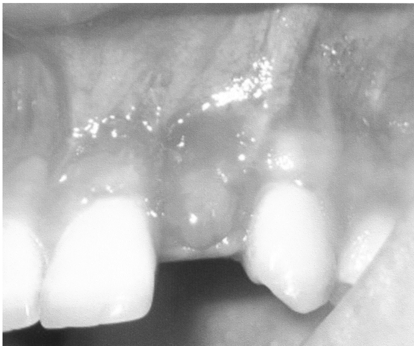
Figure 6. Clinical evaluation demonstrated successful healing 6 months after surgery. The patient reported a successful outcome.

treatment concluded with the surgical removal of the implant (8). Ayangco and Sheridan stated that retrograde peri-implantitis may occur due to implants replacing teeth with histories of failed endodontic and/or dental apicoectomy procedures (12). Oh et al. reported that an implant was lost due to a periapical implant lesion, which formed 3 months after surgery, and the authors reported that the furcation involvement at the adjacent natural tooth was the possible etiology (11). It was also suggested that surgical procedures including the removal or the resection of the infective dental implant should be performed to avoid osteomyelitis (13), and surgical