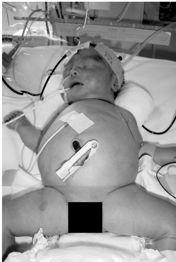
Figure 1. Abdominal distention and generalized edema of patient.

total bilirubin 3.5 mg/dl and direct bilirubin 0.1 mg/dl, gamma glutamyl transferase (GGT) 91 U/L, lactate dehydrogenase 5368 IU/L, alkaline phosphatase 290 IU/L, total protein 3.3 g/L, albumin 2.3 g/L, glucose 15 mmol/L, sodium 132 mmol/L, potassium 4 mmol/L, creatinine phosphokinase 1137 U/L, BUN 34 mg/dl, and creatinine 1.2 mg/dl. Both prothrombin time (PT) and activated partial thromboplastin time (aPTT) were normal; blood gas analysis revealed mixed acidosis. Ultrasound examination of the abdomen revealed ascites and three cystic lesions. Computerized tomography of the abdomen was performed to confirm ultrasonographic findings and showed three cystic lesions measuring 2x3cm, 6x6cm and 5x6cm filling the abdominal and pelvic area with septae and no internal echoes or calcification suggesting mesenteric, omental or ovarian cysts (Figure 2). However, on her 3rd day of life, worsening of hepatic function was observed with the following laboratory values: AST 3185 U/L, ALT 519 U/L, GGT 116 U/L, total protein 3.5 g/L, albumin 1.8 g/L and prolonged PT and aPTT. Infectious, metabolic and toxic causes of neonatal liver failure were excluded. Liver Doppler ultrasonography showed evidence of reduction in hepatic blood flow. Despite aggressive ventilatory support, her respiratory status progressively worsened and paracentesis was performed to improve pulmonary