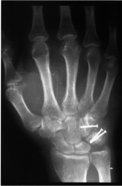
Figure 6. P-A X-ray of the right wrist 4 years after the operation.

There was no evidence of avascular necrosis after 4 years of follow-up. Although dorsiflexion of the wrist was slightly limited ( 10^{\circ} ) when compared to the other hand, pinch and grip strength were equal.