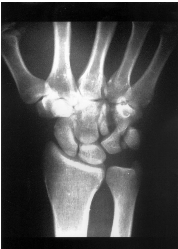
Figure 1. P-A X-ray of the patient's right wrist. Displaced fracture line is present on the body of the triquetrum and hamate. Separation between the third and fourth metacarpals is evident.

A short arm cast was used for immobilization for 3 weeks and then wrist and carpometacarpal motion was allowed. Protective splinting was used for 3 additional weeks. Solid union was achieved at the third month and the patient had 45° of dorsiflexion and 50° of palmary flexion with no pain 6 months later. There was good restoration in the carpometacarpal and intercarpal joints, and solid union in both the hamate and triquetrum. The patient regained full functioning of his right hand and returned to work the seventh postoperative month. He had no complaints after 4 years of follow-up (Figure 6).