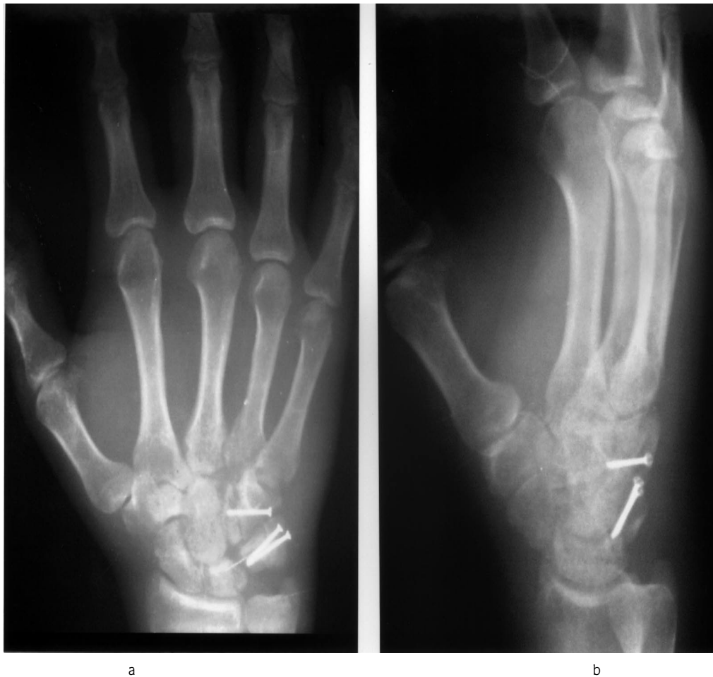
Figure 5. Early postoperative X-rays showing the location of the lag screws. a) P-A, b) lateral.