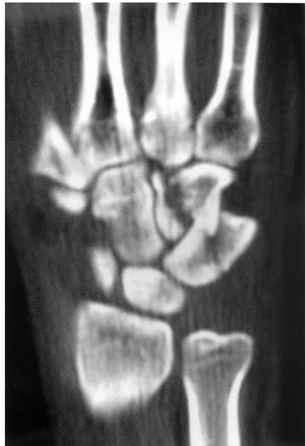
Figure 2. 2D coronary CT section of the patient's injured right wrist. The fragment of the hamate intervenes with the fragments of the triquetrum.