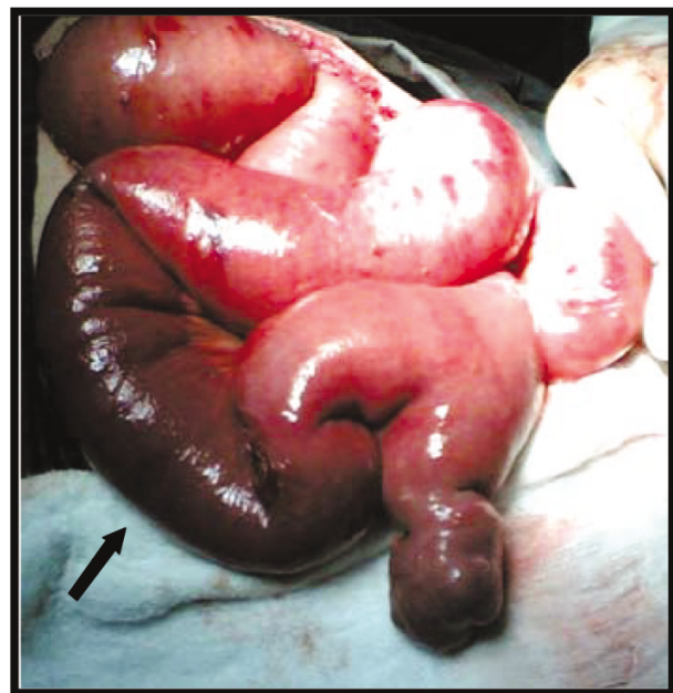
Figure 3. Meckel's diverticulum and necrotic ileal segment (arrow).