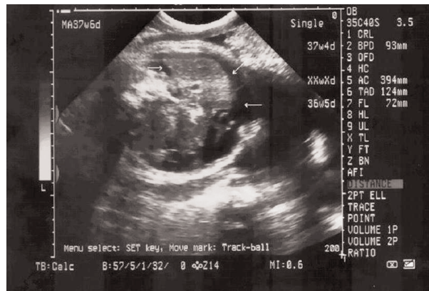
Figure 1. Ascites in the abdominal cavity during the antenatal period (white arrows).