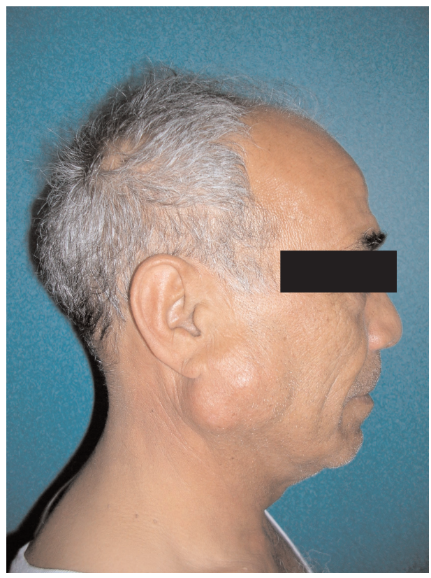
Figure 1. Preoperative picture of the patient. Note multinodular

increases with the duration of a mixed tumor (5). Some reports show that cancer eventually develop in up to 25% of untreated mixed tumors (6).