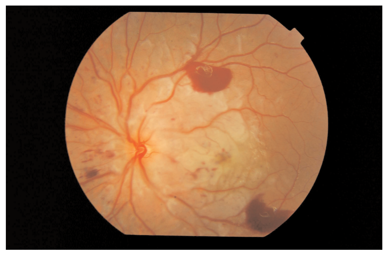
Figure 1. Retinal photograph, left eye.

continued with oral steroid treatment at a dose of 1 mg/kg for one week. One month later, visual acuity in the left eye was counting fingers from two meters, the cotton wool spots and hemorrhages had resolved, and the macula and optic disc edema continued although diminished. The visual field defect was still present.