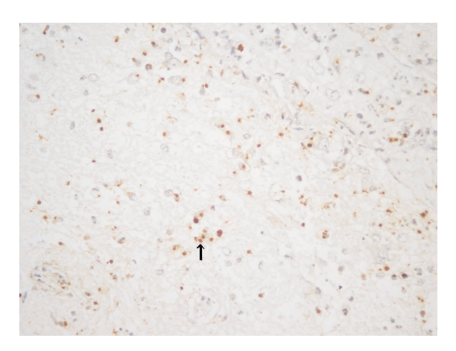
Figure 4. Immunohistochemical staining shows severe immunoreactivity of bradyzoite and tachyzoite with Toxoplasma gondii antibody (X200).

report an incidence of 2-3% in AIDS patients, when prospective studies were evaluated, the incidence of movement disorders in AIDS patients appears to be higher than previously appreciated (1).