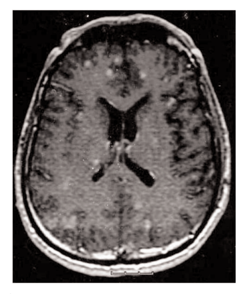
Figure 1. Multiple toxoplasma abscesses in the cerebritis stage with peripheral contrast enhancement are seen in contrast T1-weighted cranial MR images.

The routine biochemistry (including liver enzymes, blood urea nitrogen [BUN], creatinine, electrolytes) was within normal limits but erythrocyte sedimentation rate (90 mm/h), anti-HIV and anti-Toxo IgG antibodies were high. The CD4 cell count was less than 50 cells/ml and the patient received antiretroviral treatment and also