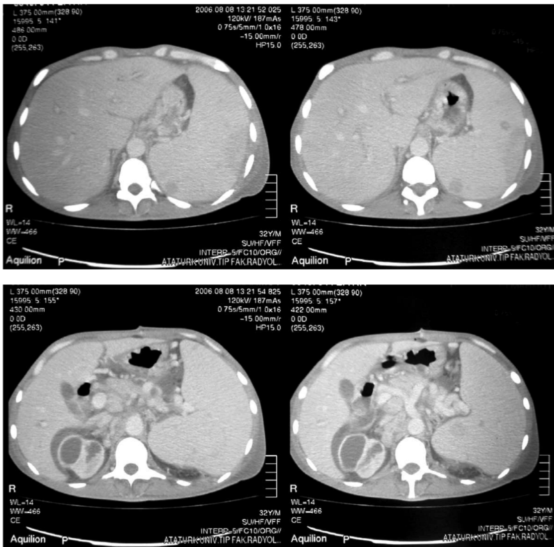
Figure 1. Computed tomography of the abdomen shows multiple paraaortic conglomerated lymphadenopathies, large liver of 200 mm, extremely large spleen 290 mm in size, necrotic infarct areas in upper and lower poles of the spleen, hypodense lesions in the spleen, and 20 mm-sized lymphadenopathy anterior to liver.

vancomycin 1 g since there was no reduction in the fever. Appropriate antibiotherapy was administered for Escherichia coli that grew in the urine culture, the specimen of which had been obtained on admission. Control blood and urine cultures were negative. Fever was not under control with this treatment. On physical examination, there were multiple lymphadenopathies in the axillary and inguinal regions, in addition to hepatosplenomegaly. In the laboratory analyses, the complete blood count revealed a hemoglobin level of 6.3 g/dl, a hematocrit of 20%, a white blood cell count of