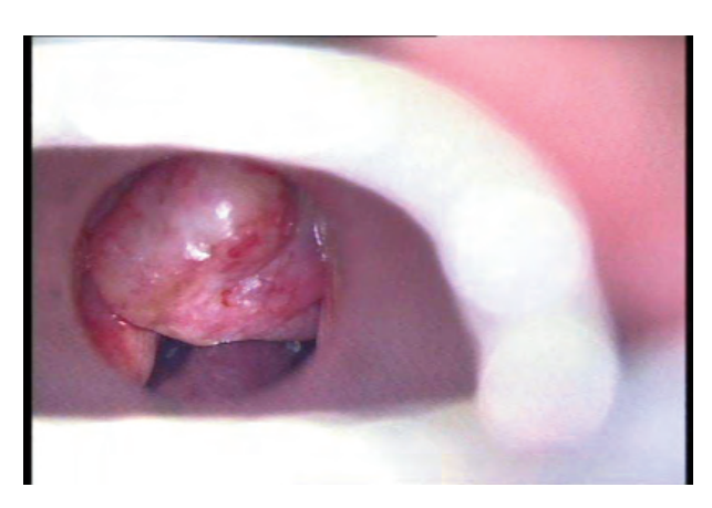
Figure 1. The photograph showing the right vocal cord hemangioma taken during suspension microlaryngoscopy.

upper surface of the right vocal cord. Direct laryngoscopy performed and it was excised microlaryngoscopic technique under general anesthesia (Figure 1). No difficulty was encountered during dissection of the lesion and bleeding was minimal, and was controlled by cauterization. The patient was stable in the post-operative period. The patient was discharged from hospital on the first postoperative day without any discomfort.. Histopathologic examination of the specimen indicated a cavernous hemangioma (Figure 2). There was considerable improvement in the voice of the patient postoperatively, and the vocal cords and their movements were normal.