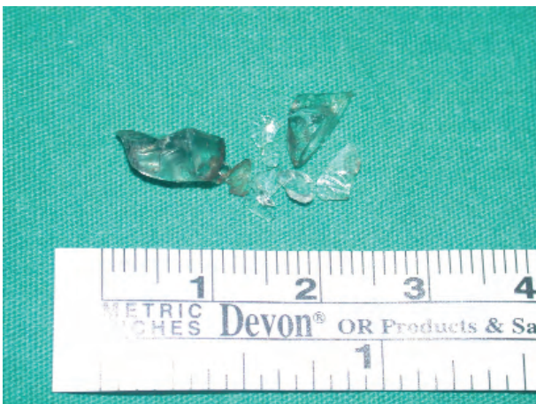
Figure 3. All glass particles were removed from the left frontal sinus.