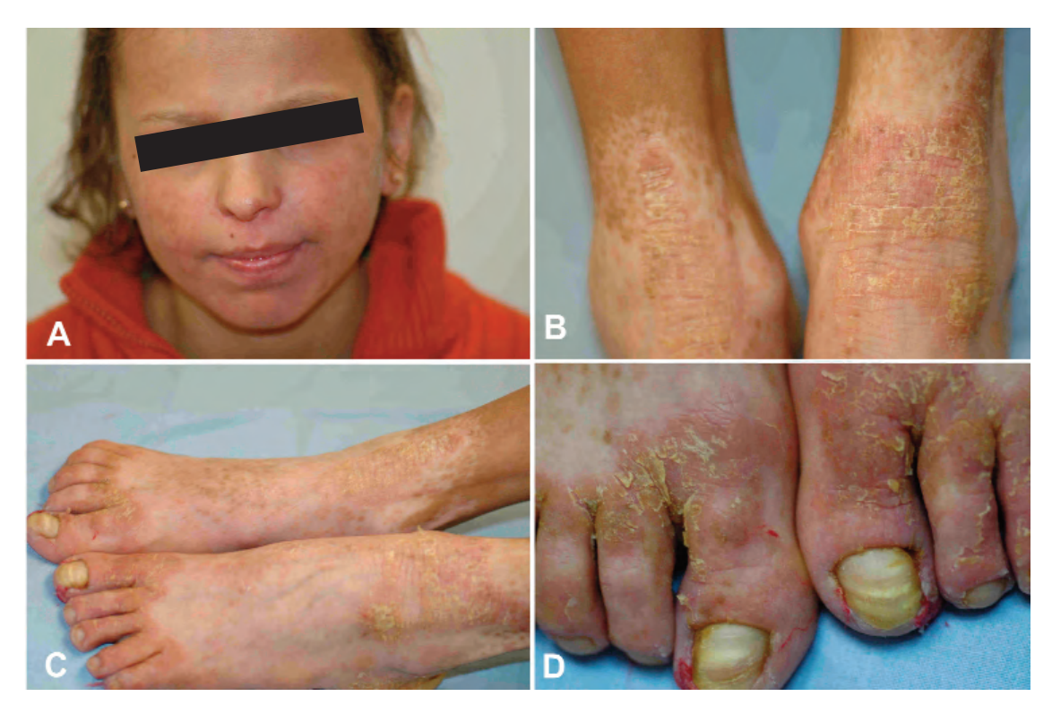
Figure 1. First patient: Perioral erythema, scaling, sparse hair, eye lashes, and eye brows (A). Erythematous, fissured, lichenified plaques on the ankle and dorsum of the feet (B,C). Nail dystrophy and subungual hyperkeratosis of the toes (D).