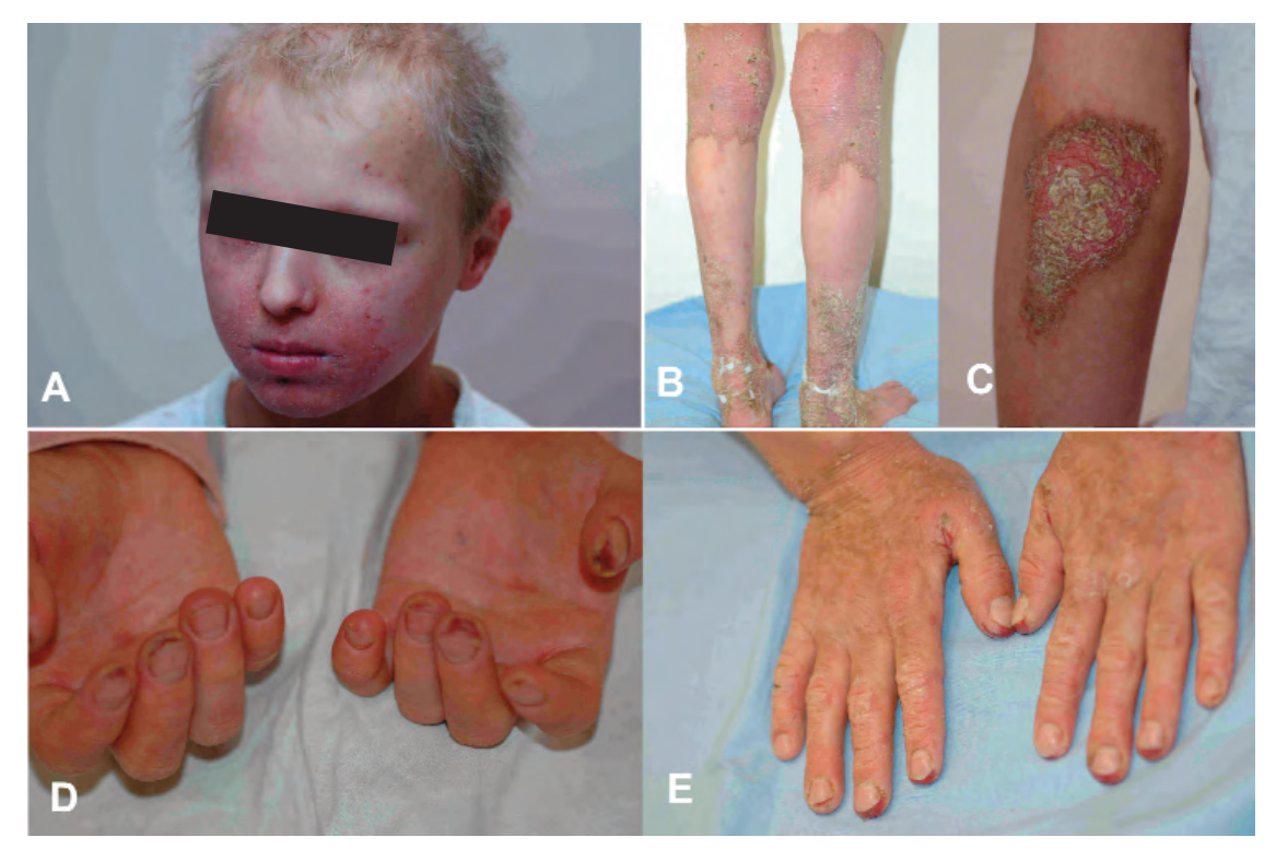
Figure 2. Image of the second patient showing the hair, eye brows, and eye lashes; also perioral region (A), erythematous and squamous plaques on the legs (B), elbows (C), and hands (D,E).