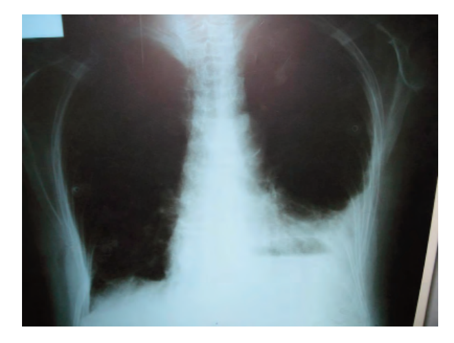
Figure 1. Chest x-ray of the first patient. Left hemidiaphragm eventration.

An eusophagogastroduodenoscopy was obtained. It revealed rotation in stomach, three large herniation pockets in fundus, major curvatura and antrum of the stomach, secondary to the volvulus. However, no bleeding focus was seen. She was operated, volvulus was corrected and paraesophageal hernia was repaired. Finally, she was discharged home healthy.