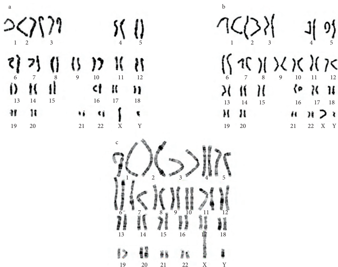
Figure 1. GTG banded karyotypes showing a) case 1; b) case 2; and c) case 3.

their lymphocytes. Silver-NOR banding showed the Yqs chromosome in both the father and the grandfather. Double satellites on the short arm of chromosome 15 were also observed in both father and grandfather.