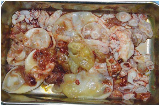
Figure 3. Resected daughter vesicles and cyst membrane.