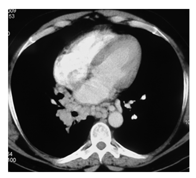
Figure 1. Hyperdense tubulonodular formations compatible with subcarinal, paraesophageal, and right infrahilar enlarged vascular structures.

Bronchoscopy was performed in all cases. Rigid bronchoscopy was performed in the operating room on the patients operated on emergently, due to massive hemoptysis. Fiberoptic bronchoscopy was performed electively in the other cases. In 18 cases, there was active hemorrhage: hematoma in four, inactive hemorrhage with evidence of previous bleeding in four, endobronchial lesion in three, telangiectasia in two, mucosal irregularity in one, and vascular fistula in one. The other cases revealed normal findings. The biopsy results of the patients with endobronchial lesion indicated squamous metaplasia in one.