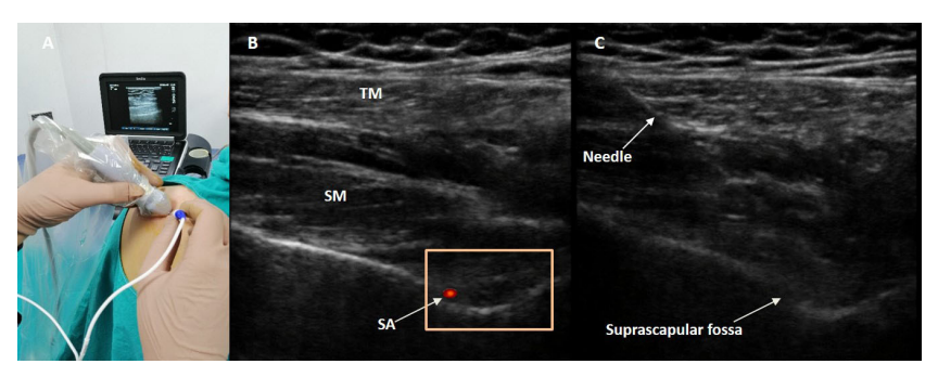
Figure 1. A) The positioning of the linear ultrasound transducer and radiofrequency electrode. B) Scanning of the suprascapular nerve with linear ultrasound probe; trapezius muscle (TM), suprascapular muscle (SM), suprascapular notch, and color Doppler imaging of the suprascapular artery (SA). C) Real-time imaging of the needle insertion under ultrasonographic guidance.