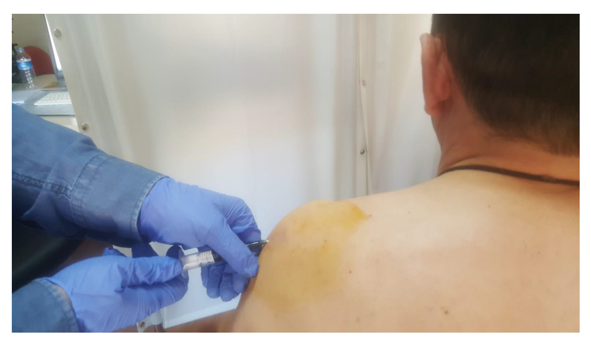
Figure 1. Subacromial glucocorticoid injection was applied via a palpation-guided posterolateral approach to all patients.

Patients were divided randomly into two groups equally. Group 1 consisted of 42 patients who received one session of mobilization (OSM) and SACS treatment (OSM group) whereas Group 2 (n = 42) consisted of patients who only received SACS injections (SACS group). Randomization was done using a computer with assignments placed in opaque and sequential numbered envelopes by an off-site researcher who was not involved with patient care or follow-up. A single SACS injection (20 mg triamcinolone hexacetonide) was applied via palpation-guided posterolateral approach in all patients (Figure 1). Mobilization was administered as a single session right after SACS injection. Glenohumeral anterior, posterior and inferior gliding, posterior capsule