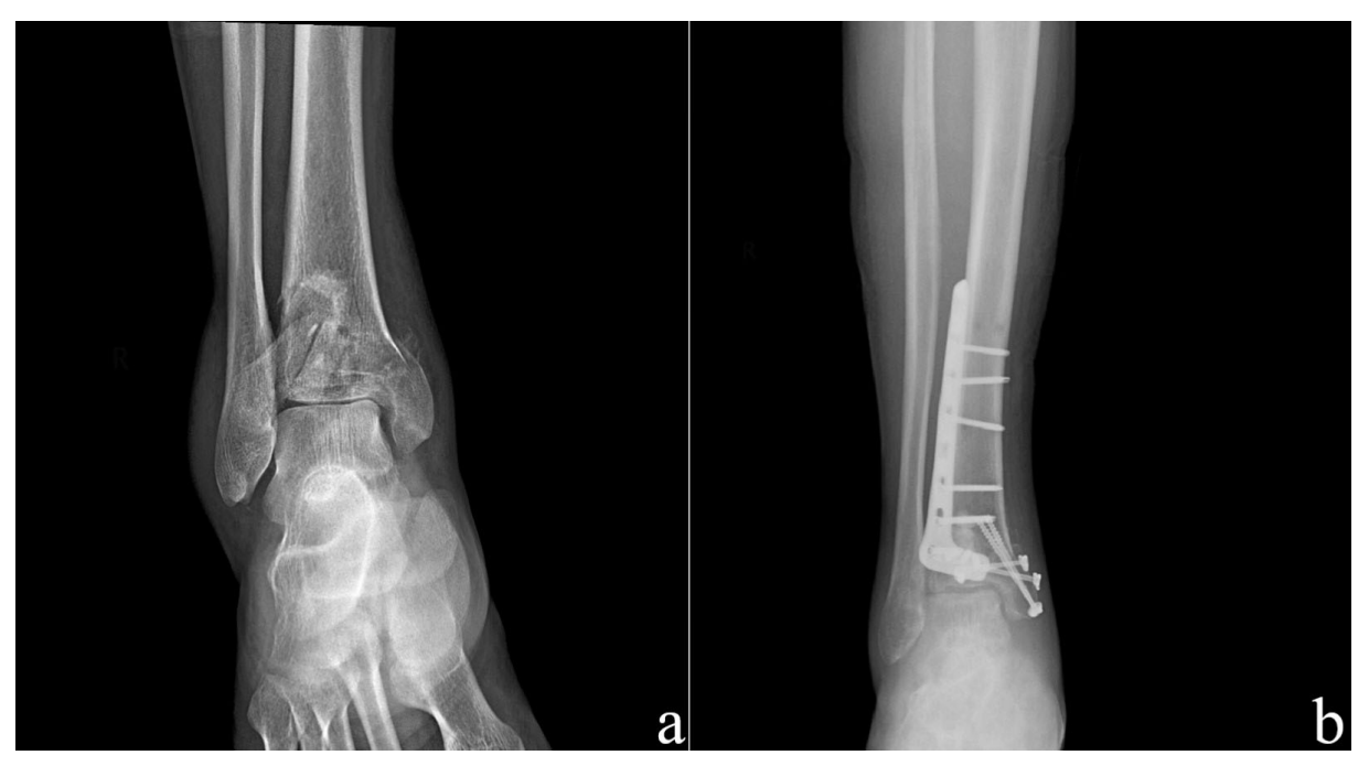
Figure 1. Preoperative (a) and postoperative (b) x-ray images of single step surgery.