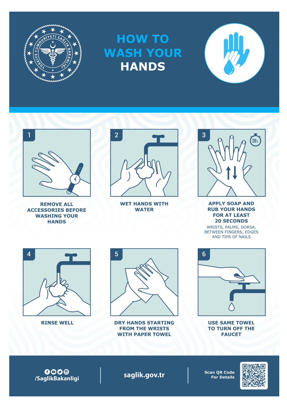
Figure 2. Poster regarding hand washing, prepared by Turkish Ministry of Health.