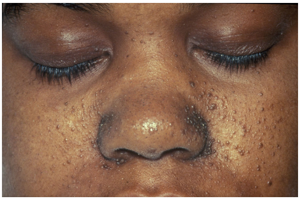
Figure 2. Facial angiofibromas<sup>1</sup>.

The incidence of TSC has been estimated as occurring in 1/6000-10,000 newborns annually, and therefore, it