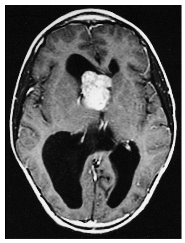
Figure 1. MRI of a SEGA<sup>1</sup>.

<sup>1</sup> Image courtesy of Wikimedia Commons [online]. Website https:// commons.wikimedia.org/wiki/File:MRI_of_brain_with_subependymal_giant_cell_astrocytoma.jpg [accessed 05 January 2020].