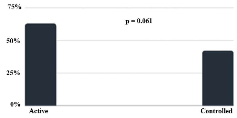
Figure 1. The prevalence of hard nodules according to disease activity in patients with acromegaly.