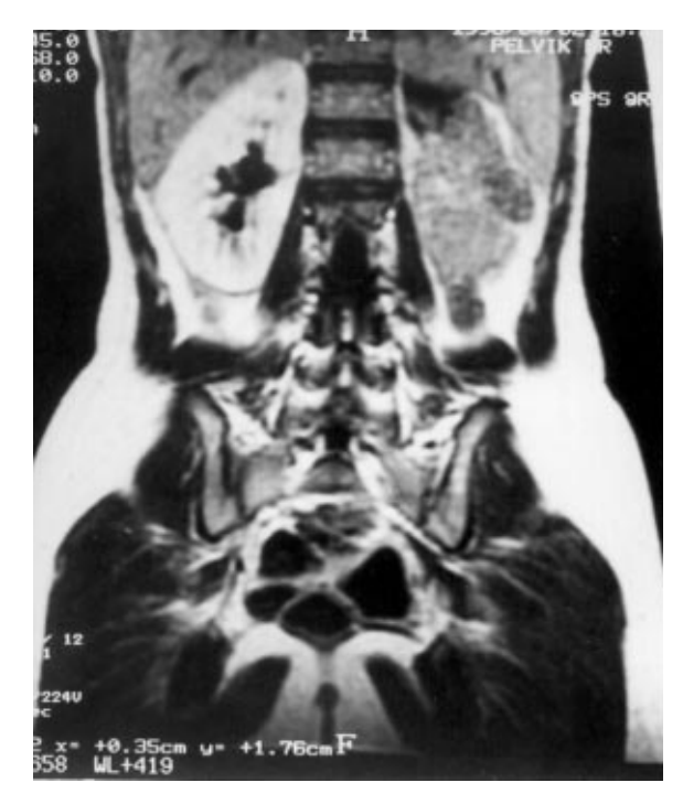
Figure 1. T1-W coronal image. Left renal agenesis and enlarged right kidney.

Pelvic ultrasonography demonstrated two seperate uterine bodies and a cystic mass of 38x23x25 mi-